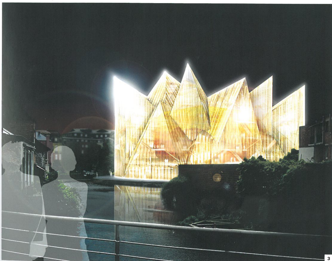
1 Functional scheme. 2 Plan. 3 Rendering.